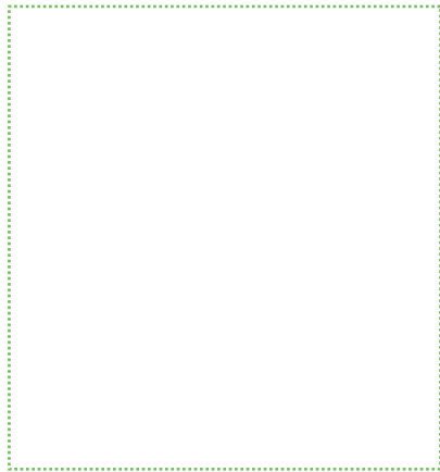
Artwork scale: 25% Max print area: 225 x 210 mm