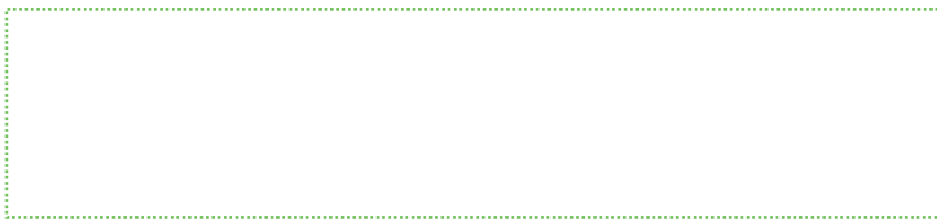
Artwork scale: 50% Max print area: 225 x 50 mm