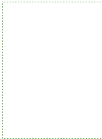
Artwork scale: 25% Max print area: 120 x 200 mm