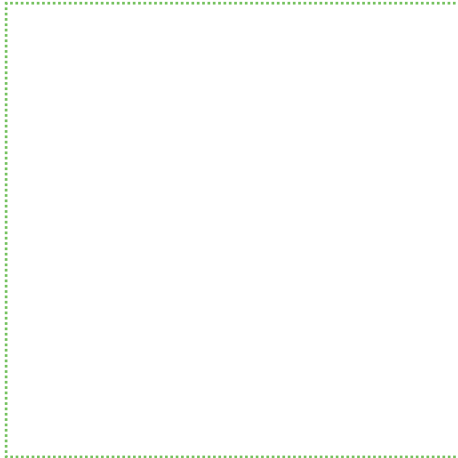
Artwork scale: 50% Max print area: 120 x 120 mm