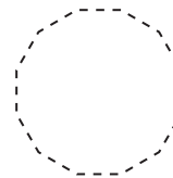
20 mm dia