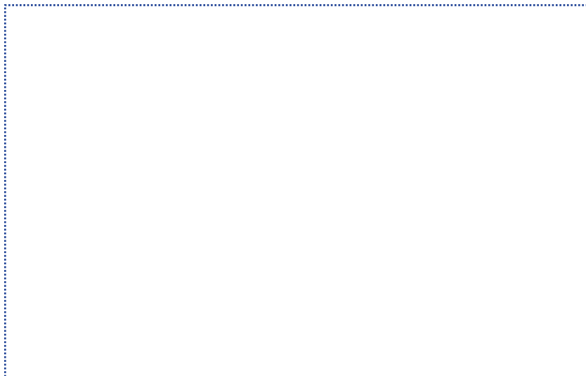
Artwork scale: 100% Max print area: 70 x 110 mm