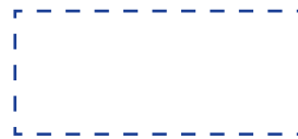
35mm x 15mm