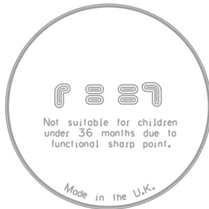
REVERSE OF MOULDING