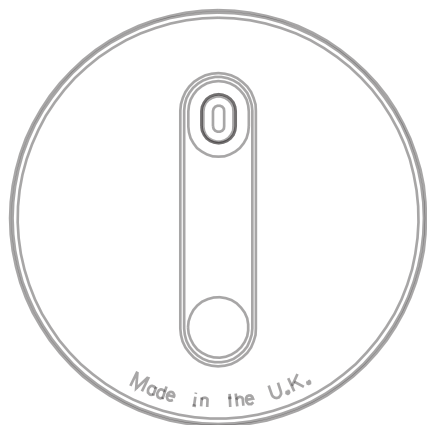
REVERSE OF MOULDING