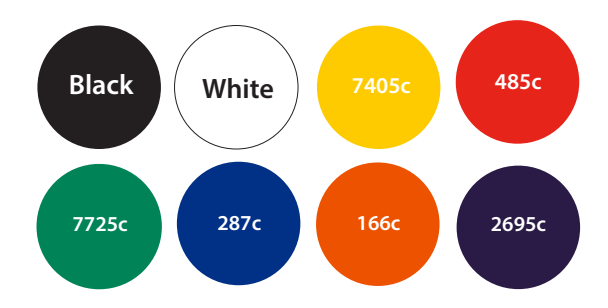
closest approximated colour match