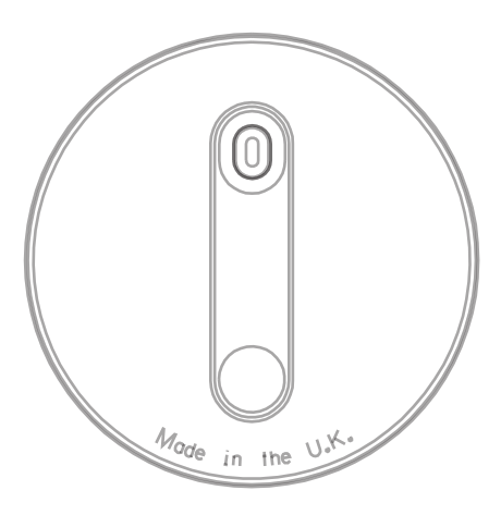
REVERSE OF MOULDING